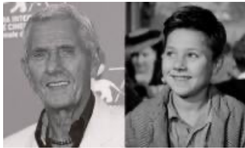
Former 'Bicycle Thieves' Child Star Enzo Staiola Dies At 85

Supreme Court issues judges' roster and cause list for judicial week beginning Tuesday, June 10