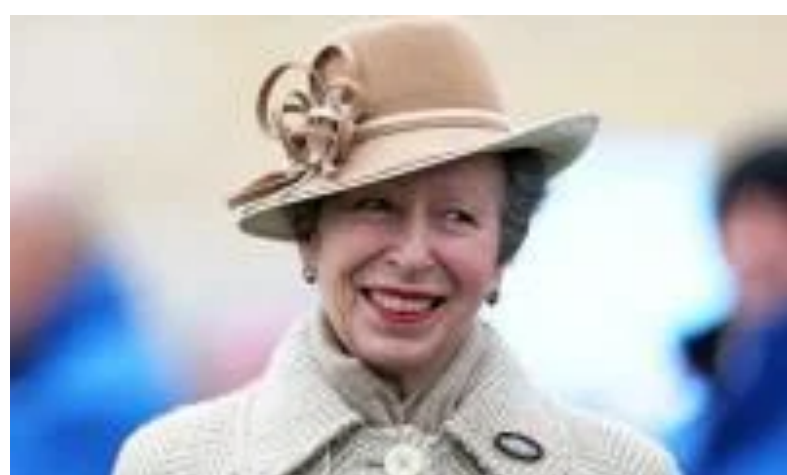
Princess Anne Gives Key Speech At Buckingham Palace Ahead Of 75th Birthday