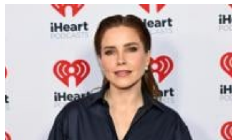
Sophia Bush Recalls Grueling Experience On Set Of TV Show