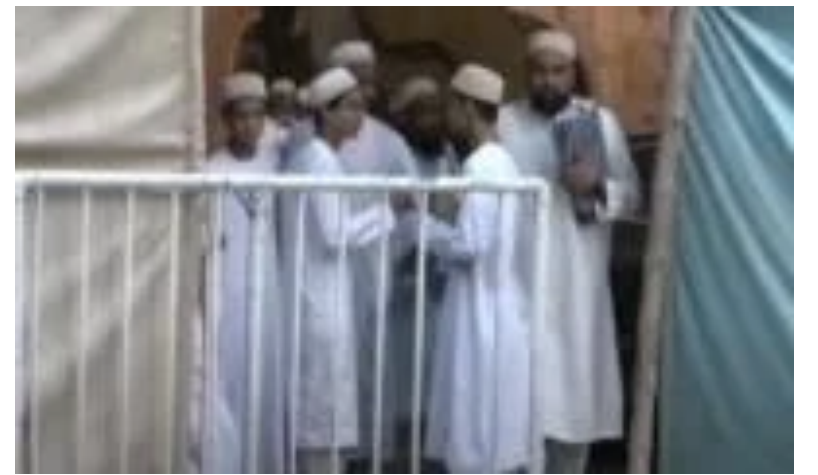
Karachi's Bohra Community Marks Eid Ul Adha Today