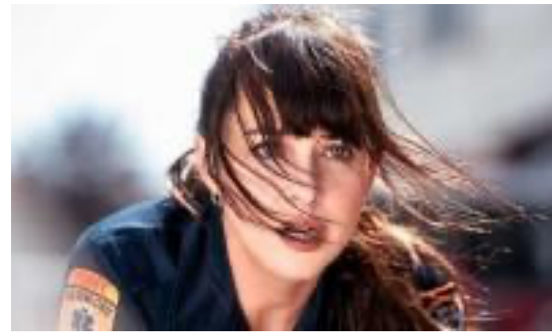
Dakota Johnson Blames 'uncreative' Decision-makers For 'Madame Web's' Failure