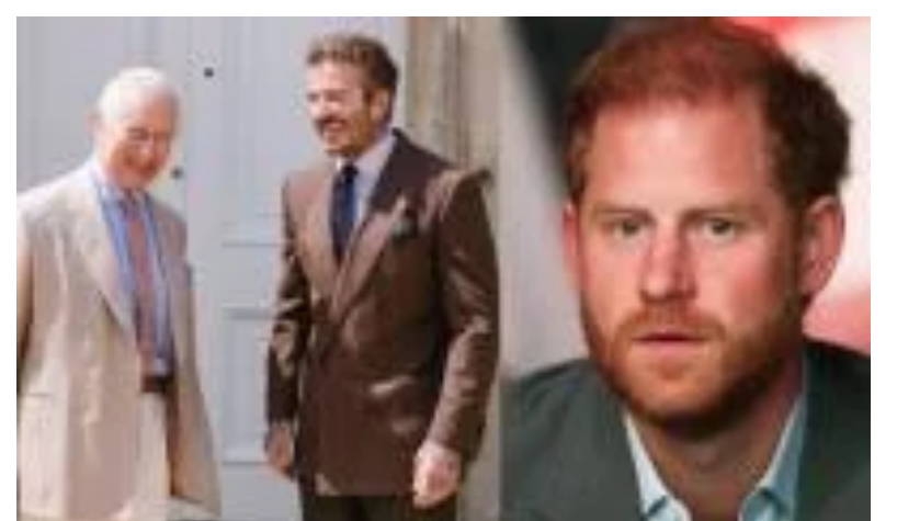
King Charles To Honour David Beckham After Closing Palace Doors On Harry