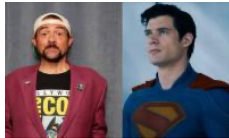
Kevin Smith Shares Honest Thoughts About James Gunn's 'Superman' Trailer