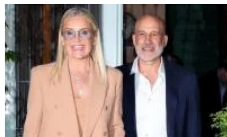
Yolanda Hadid No Longer Engaged To Joseph Jingo After 7 Years Together