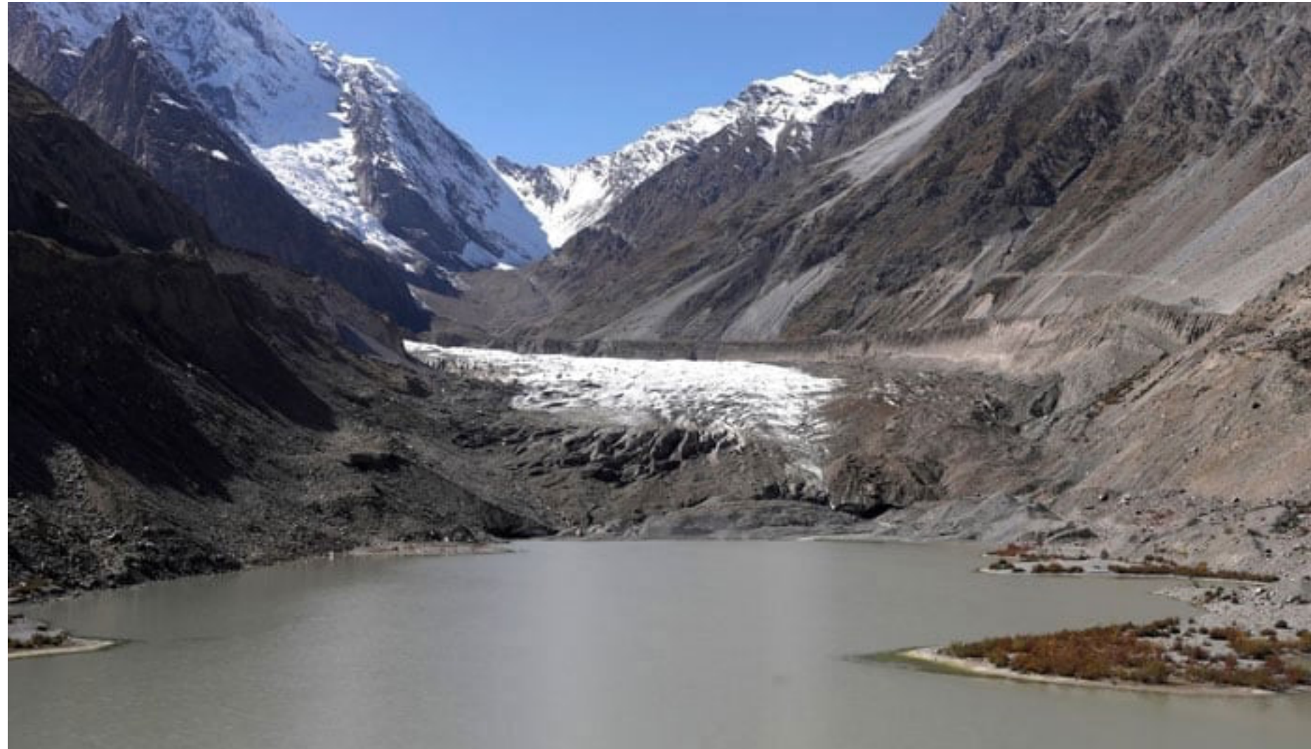
The Gamoo Bhr glacial lake pools in front of the Darkut glacier in Darkut village, Yasin valley, in the Gilgit-Baltistan region of Pakistan, October 11, 2023.

ISLAMABAD: Pakistan is now home to 2,772 supra-glacial lakes—seasonal water bodies forming on melting glaciers, which pose both a growing threat and a scientific opportunity, Italian experts said on Thursday, urging continuous monitoring to prevent future disasters linked to climate change.