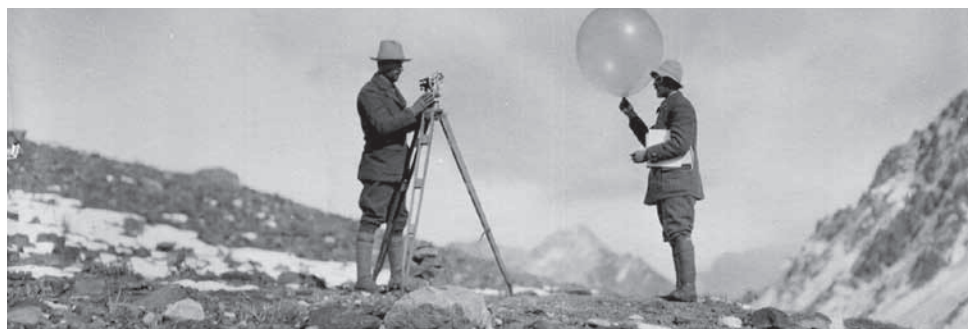
De Filippi Exhibition in Florence

De Filippi returned in that area in 1913-1914 for a great scientific expedition, that passed through the Central Asia and reached the far Chinese Turkestan. For his valuable investigations he received many honors from British and foreign scientific societies, and he is a gold medalist of the English and Italian Royal Geographical Societies.