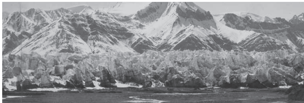
Final Expedition survey on Rimu Glacier De Filippi 1913-1914 Expedition - Camp at the Glacier's front lat 35° 21' 0.80" N lon 77° 38' 46.56" E Heading: 65°

Few months later, in August, the group reached Kashgar in the Chinese Xinjang. Due to the First World War, the way back across the Russian Asia was very difficult and done by foot and train.