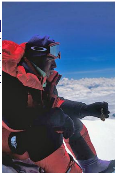
ExplorersWeb file image of climber high above the clouds reflecting on his recent Everest summit.