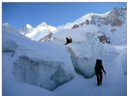
Climbers on the Gasherbrum glacier (G1 in background)